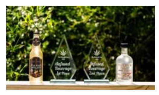
1<sup>st</sup> Place – Tinley's<sup>™</sup> "High Horse" 2<sup>nd</sup> Place – Tinley's<sup>™</sup> "Coconut Cask"